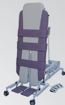
Tilting Table (Option)