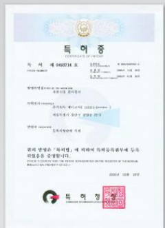
Patent for ANS Function